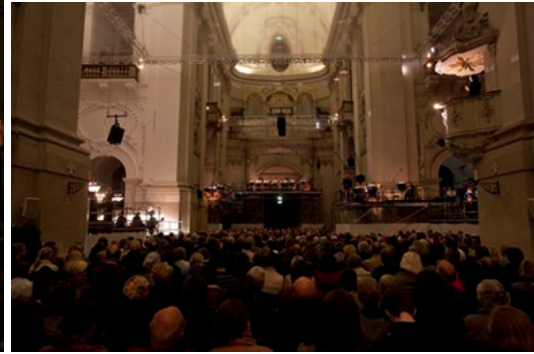
Luigi Nono, Prometeo , Salzburg Festival 2011: Ingo Metzmacher conducts Ensemble Modern at the Kollegienkirche.