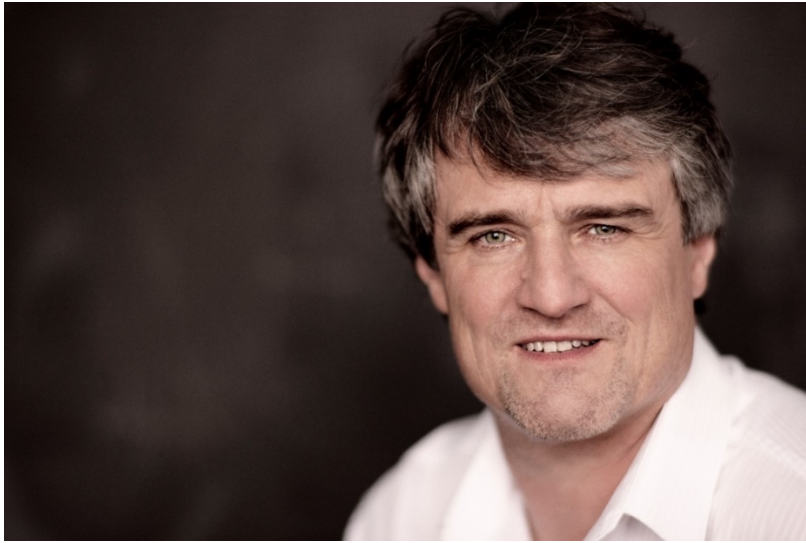
Ingo Metzmacher

You knew Luigi Nono personally and are presumably the conductor most familiar with his work. Could you describe the importance of Intolleranza 1960 for you, personally and musically?