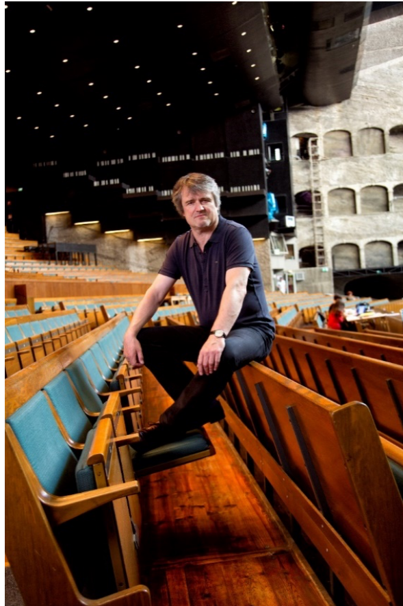
Ingo Metzmacher at the Felsenreitschule, Salzburg.